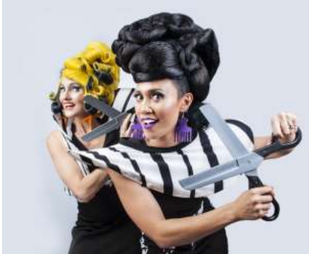
Photo: The Big Hair Show, Polytoxic

Welcome to a world of big hair, frizzy fantasy, curly cabaret and wild performances. A fabulously kitch hair salon is opening for business at Meriton Festival Village.